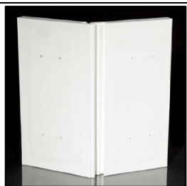
Re-Breakable Board White (Soft Difficulty)